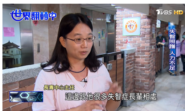
Note: A Student of our program as the director of elderly service center interviewed by TVBS Media.