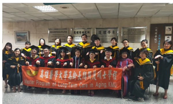
Note: Our happy family in Kaohsiung Medical University. The Master Program of Long-term Care in Aging Class 2018