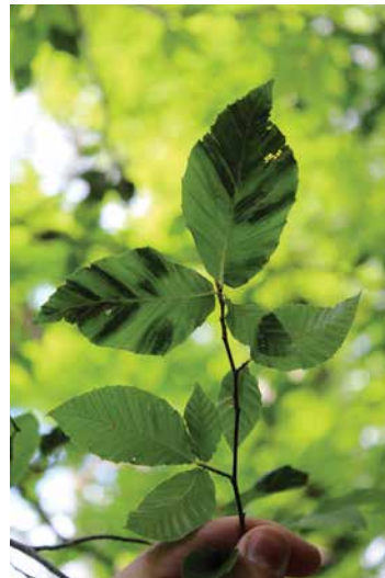
Figure 1.—Banding appearance associated with BLD.

BLD appears to be spreading, particularly from west to east based on the number of new county detections in 2019 and 2020. Insect or avian vectors as well as human-mediated movement of the nematode are possible modes of its dispersal that are currently being studied. There is likely a delay between initial nematode infestation and BLD detection as L. crenatae has occasionally been confirmed in asymptomatic tissue at the molecular level.