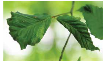
Figure 2.—Banding appearance and shrunken leaves associated with BLD.