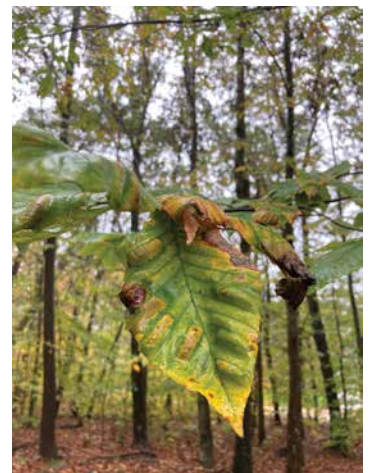
Figure 3.—Advanced symptoms of BLD with chlorotic striping.