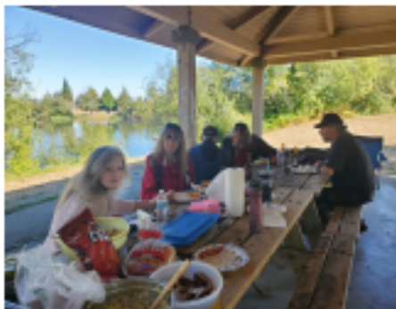
Great food, good weather, and a beautiful place. That's how meetings are done.