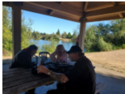
Shady goes on among the officers.