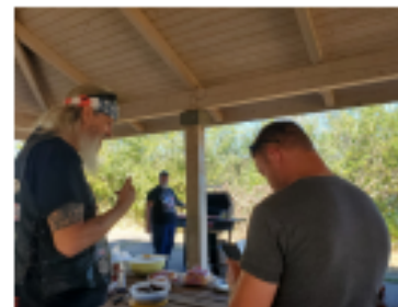
The top brass of GH ABATE and the Old Hippys.