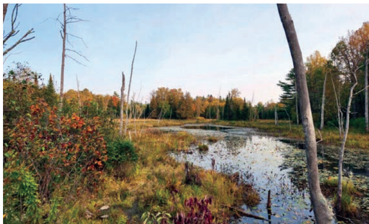
Conserving prime wetland habitat in eastern Canada for waterfowl and migratory birds in the Atlantic Flyway.