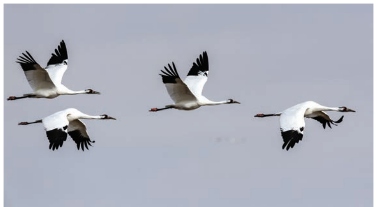
A quartet of whooping cranes flies over the Platte River.