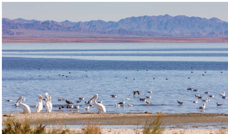
Partners are coming together to restore habitat for pintails and hundreds of migrating species. SALTON SEA, CALIFORNIA.