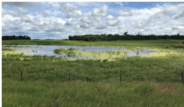
Conservation of wetland and grasslands provides nesting habitat in Canada.

Far to the south, pintails winter at California's Salton Sea, where shrinking waters threaten both birds and people. Thanks to the Salton Sea Conservancy, diverse partners are coming together with bold investments to restore habitat and renew hope for pintails and the communities that share their home.