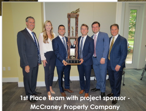
1st Place Team with project sponsor - McCraney Property Company

UF Nathan S. Collier MASTER OF SCIENCE IN REAL ESTATE WARRINGTON COLLEGE of BUSINESS