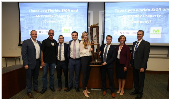
1st Place Team