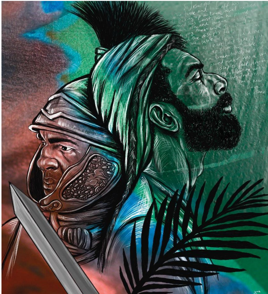
“Power Play” by Lisle Gwynn Garrity A Sanctified Art LLC | sanctifiedart.org