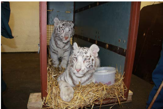
White tiger cubs await transport to a zoo.