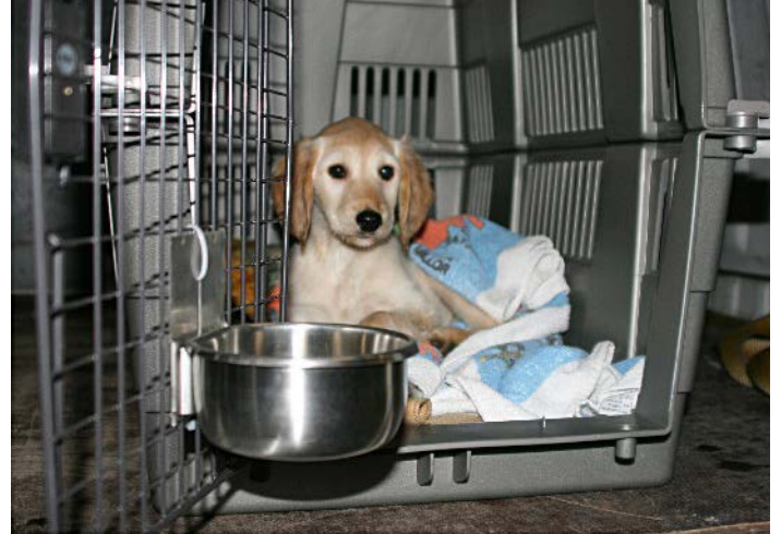
A family pet travels with all the comforts of home, including plenty of water, a favorite toy and soft bedding.