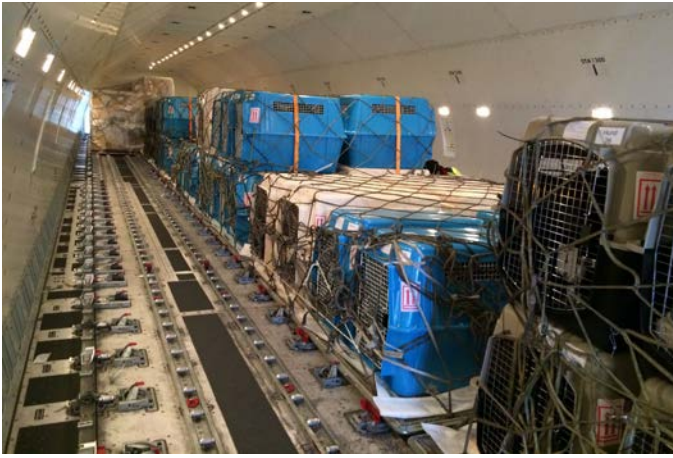
Working dogs from training schools in Germany are shipped in crates by air to police and fire departments in the United States.

them to rebuild that crate overnight. The next morning at 8, the crate was waiting for us at the airport. We then had to transfer the bear from one crate to the other. But the animal didn't want to move. Finally, the woman from the zoo who was escorting the bear suggested using marshmallows to get him into the new crate and that worked. He arrived at the zoo two days later."