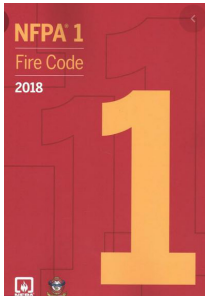
NFPA 1 (2018)