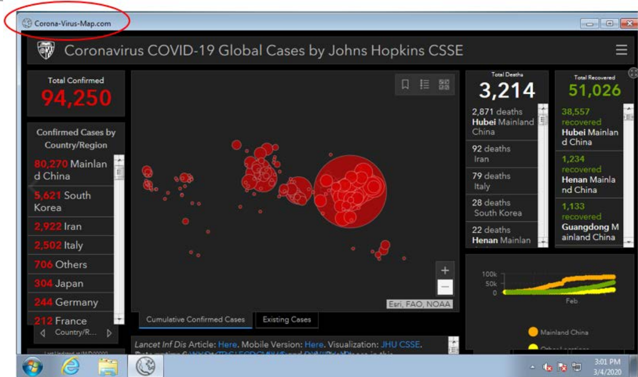
Figure 1. Screenshot of the malicious website "Corona-Virus-Map[dot]com" pretending to be a legitimate COVID-19 tracker.