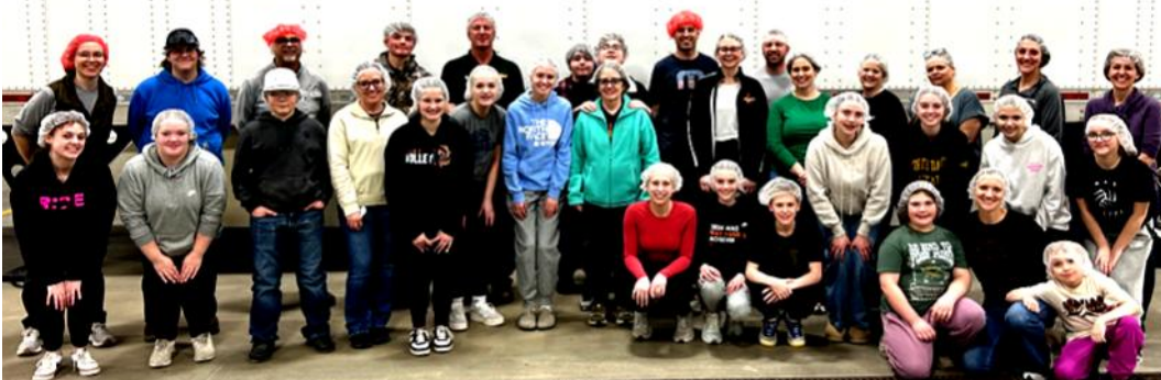
OSL & Melo Youth + Friends + Chaperones attended the Feed My Starving Children Mobile Pack Event in Grand Forks on April 11th. They helped pack 326,592 meals! To learn more about Feed My Starving Children go to FMSC.org