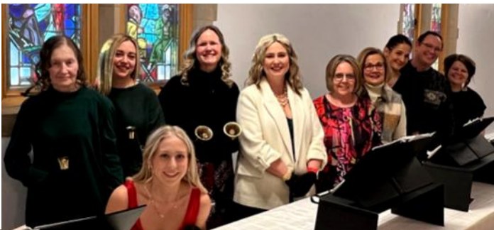
OSL Bell Choir performed at Candlelight Ser-