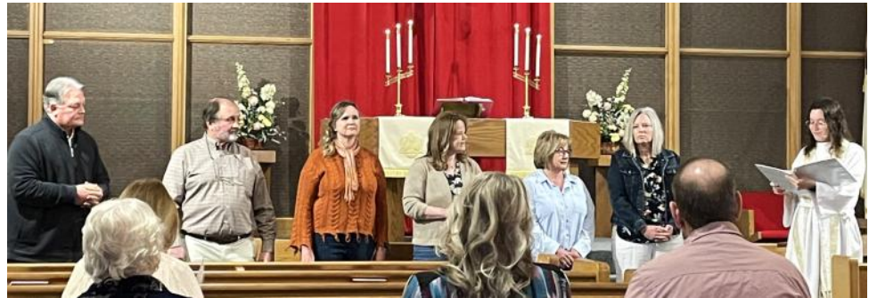
Installation of OS� Council Members on April 26. A huge thank you for your dedication & awesome work!