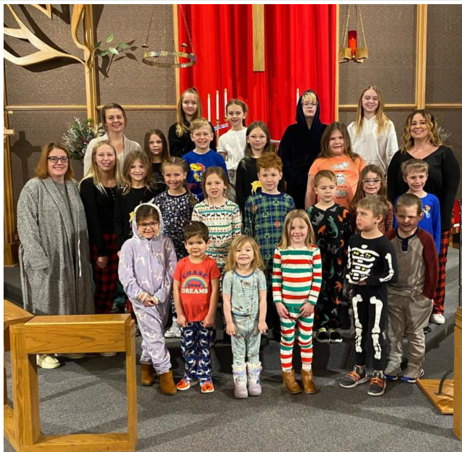
The Sunday School Kids enjoyed Pajama Day!

Cookie Baking Night at OSL! Cookies were served at coffee fellowship at OSL and Youth will deliver to some of our homebound members!