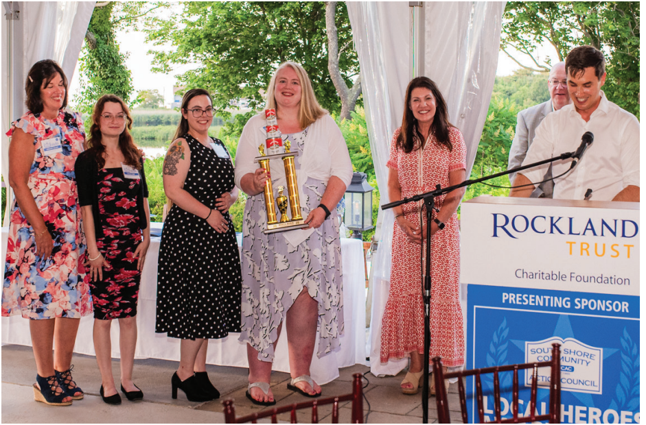
2025 March Mania Food Drive Tournament Champions - North Easton Savings Bank - receiving the John van Hengel Trophy at SSCAC's 30th Annual Local Heroes Awards Night!