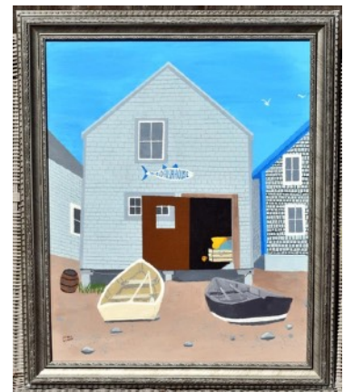
“Fish House” Acrylic - 19 x 23” Framed Unframed 16 x 20”