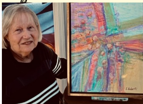
"A Group of People In Pastel"