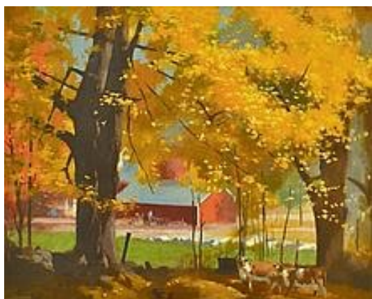
"Autumn Colors" - Oil