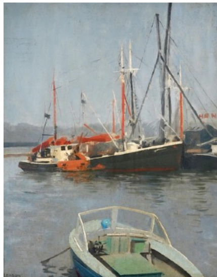
Mooring 62 x 52 x 4 cm