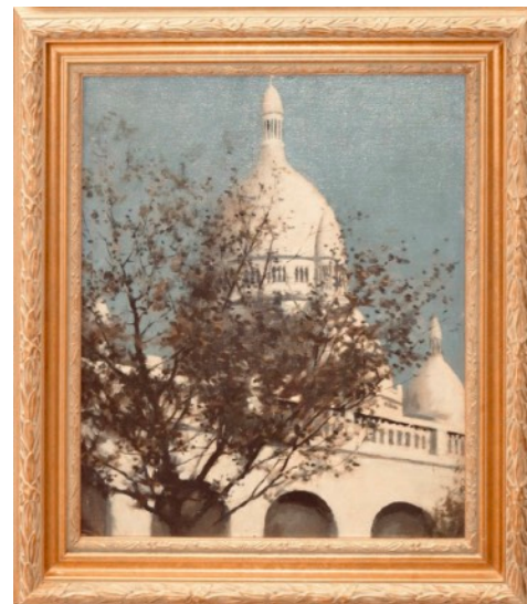
SACRE-COEUR, PARIS C.1957 OIL ON CANVAS BOARD, 45 X 38CM,