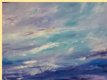
"Windswept", Acrylic. Brush & Palette Knife. 24 x 30"