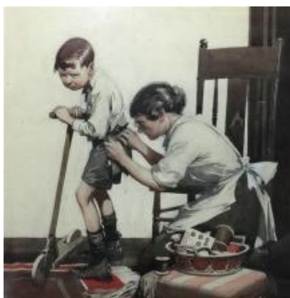
"A Stitch in Time" Watercolor