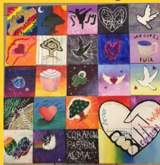
Art Workshop Collaboration with CHOP's Teen Club