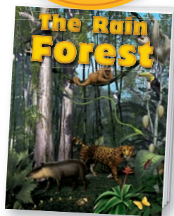
The Rain Forest Genre: Informational Text SCIENCE