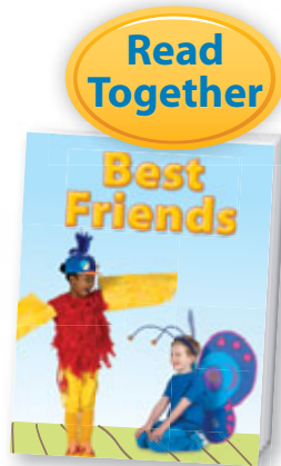
Best Friends Genre: Readers' Theater SCIENCE