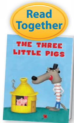
The Three Little Pigs Genre: Fairy Tale TRADITIONAL TALES