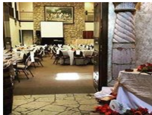
Sit Down Dinner in the Alamo