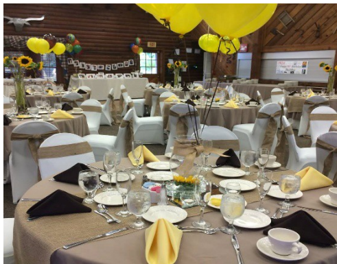
Birthday party in the Hope Lodge