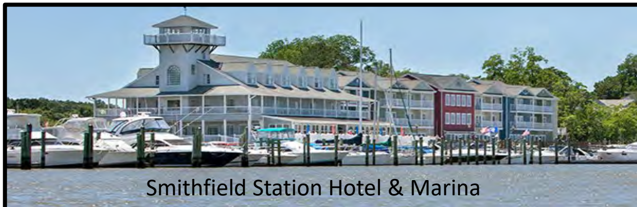
Smithfield Station Hotel & Marina

Recreational opportunities, historic sites, and the town of Smithfield drive tourists to Isle of Wight County, 43% of whom come from out of state, generating a total economic impact of over $58 million in 2021. Smithfield is routinely cited as one of the Most Beautiful Small Towns in Virginia. See https://www.onlyinyourstate.com/virginia/small-towns-va/ . Those tourists and locals generate combined average daily traffic of 38,450 Vehicles Per Day at the intersection of Benns Church Blvd and Brewers Neck Blvd. The property will enjoy even greater traffic generated by the recently approved Riverside Smithfield Hospital, that will share the intersection with the subject property. See https://www.riversideonline.com/about/riverside-smithfield-hospital