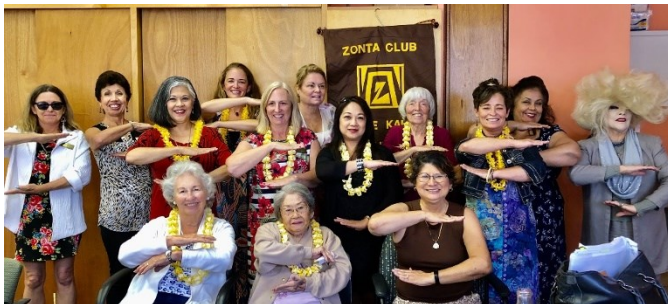
#EachforEqual2020 sign for International Woman's Day was demonstrated by ZONTA Club of Kaua'i at their General Membership meeting. #IWD2020

#EachforEqual Club members shared that "Zonta members are advocates for women's issues" including equality AND "Face-to-Face comprise, compassion & Empowerment for a better, thriving community"