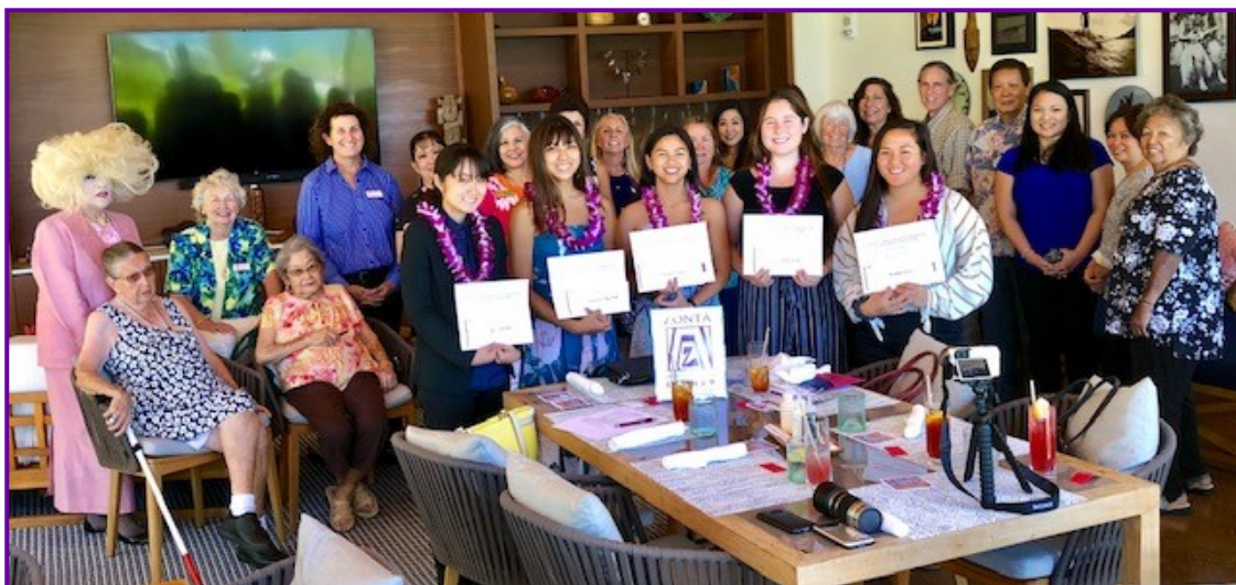
2019 scholarship winners surrounded by Zonta Club of Kauai members and their families at the May 9th Scholarship presentation.