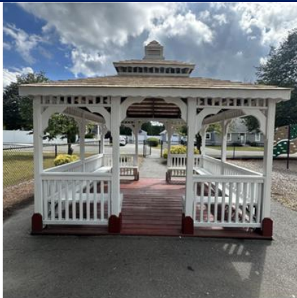
Before and After- Ducharme Park