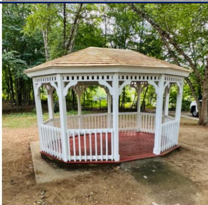
Before and After- Sweeny Park