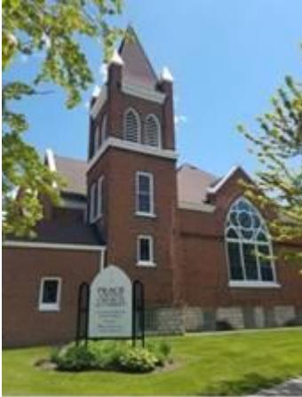
Peace UCC Marinette WI Originally Friedens Evangelical (German) Church

We will rededicate the Church and its mission during two days of history, music, worship, food, and fellowship!