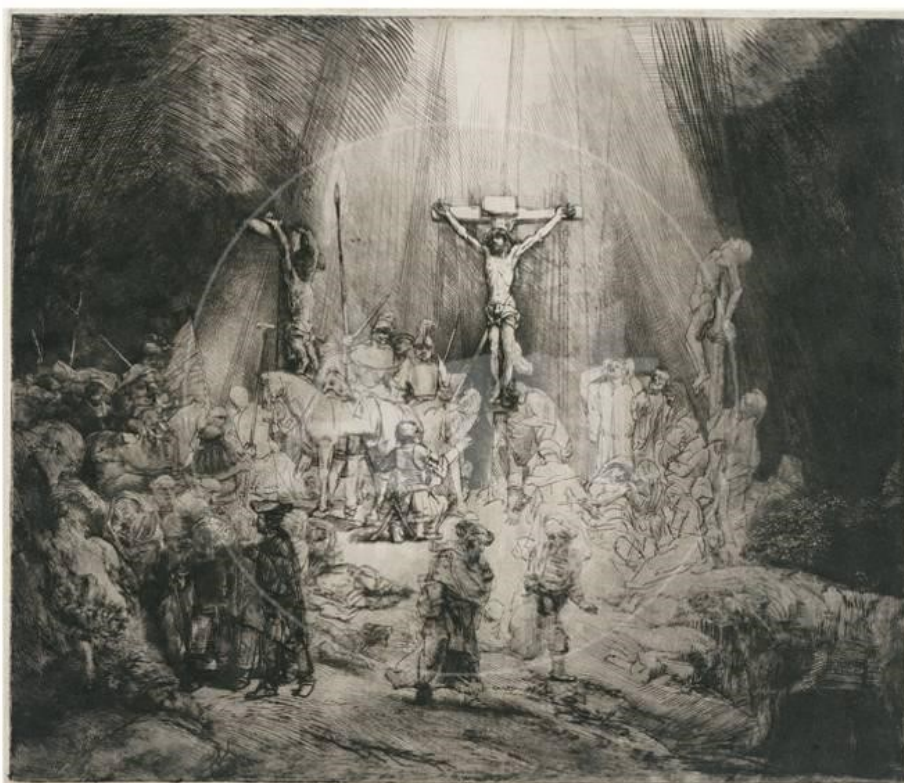
The Three Crosses, C. 1653, Rembrandt