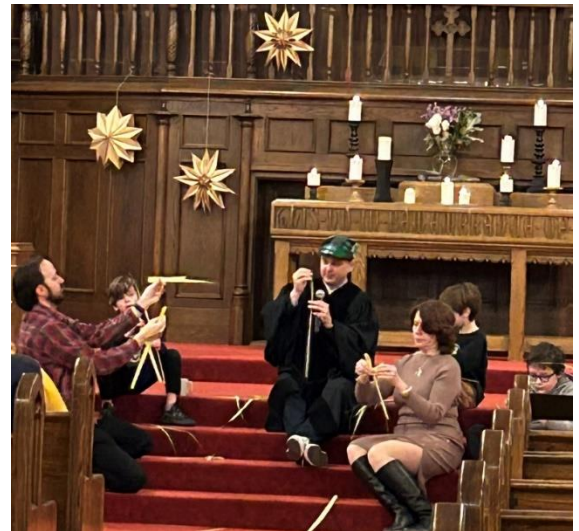
Childrens Time 3/24/24 – Crosses out of palms