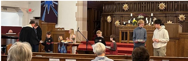
Children helping to serve communion