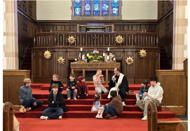
Childrens time 2-4-24