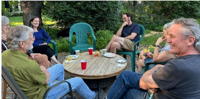
Choir party on Wednesday, June 5,