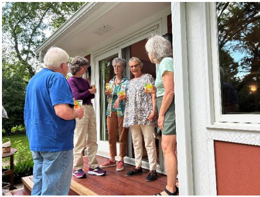
SCENES AT JUDSON