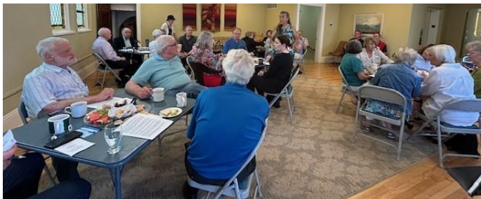
Fashioning a Bright Future Together – second hour meeting on Sunday, June 9, 2024