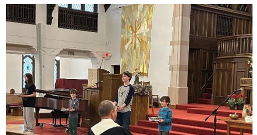
Children helping with Communion