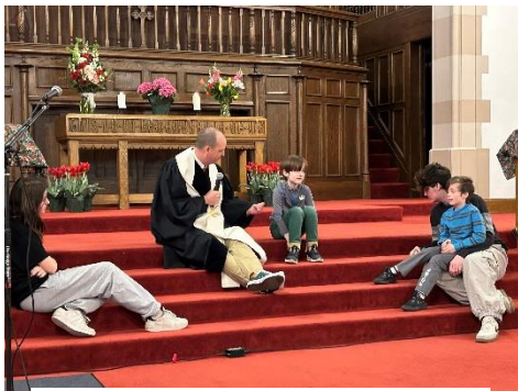
Time with Children 4/7/24