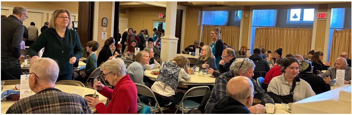
Crown enjoying soups, bread, and dessert. Over 500 people went through the line.