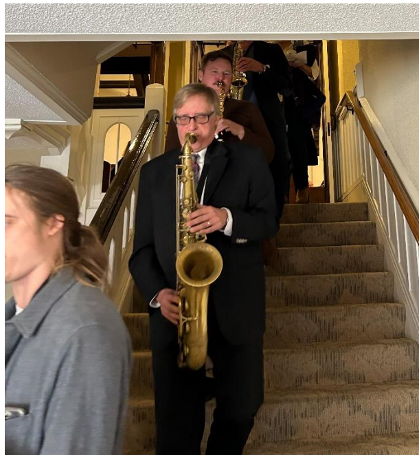
2-11-24 Jazz Sunday/ Jazz Allstars leading the congregation downstairs to the Souper Bowl.