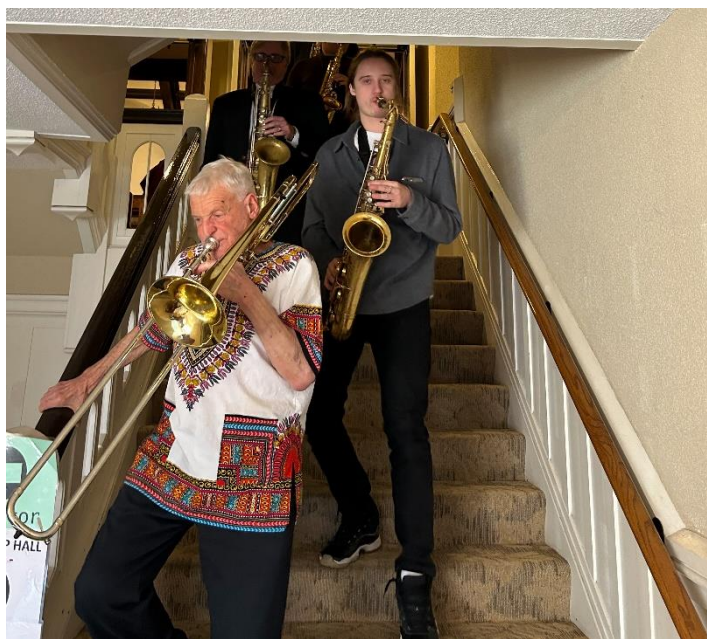
2-11-24 Jazz Sunday/ Jazz Allstars leading the congregation downstairs to the Souper Bowl.