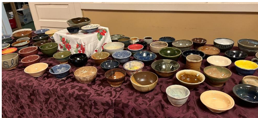
2-11-24 – Bowls available to purchase for Souper Bowl.