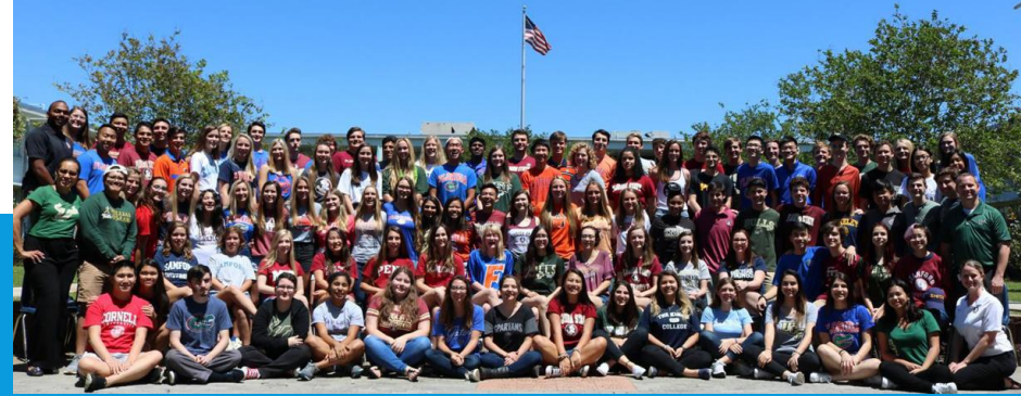
Robinson High School International Baccalaureate Class of 2018