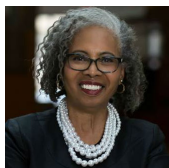
Dr. Gloria Ladson-Billings

Culturally Relevant Pedagogy: Asking a Different Question