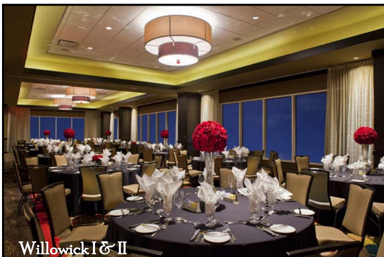
Willowick I & II