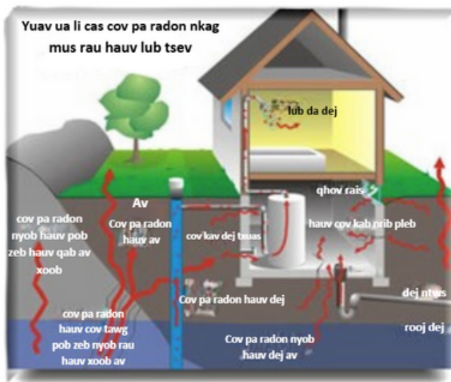
Cov pa radon yog ntsuas haub picocuries ntawm cov pa radon ib lij ntawm cov huab cua ( pCi/L ).