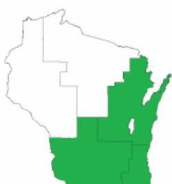
STATE OF WISCONSIN