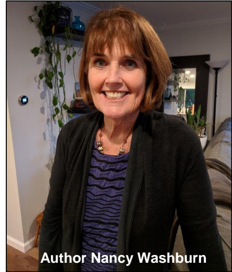
Author Nancy Washburn

Tools to feel competent as a parent of a teenager - Engaging stories with simple lessons for parenting your teen - Simple messages that all teens need to hear to grow up emotionally healthy - Knowledge of what all teens are experiencing developmentally - Advice on how to navigate important and difficult conversations with your teens - Examples of how to shift from conflict with your teen into responsiveness and enduring connection - Ways to foster your teen's success in life and build a lasting parent-child bond