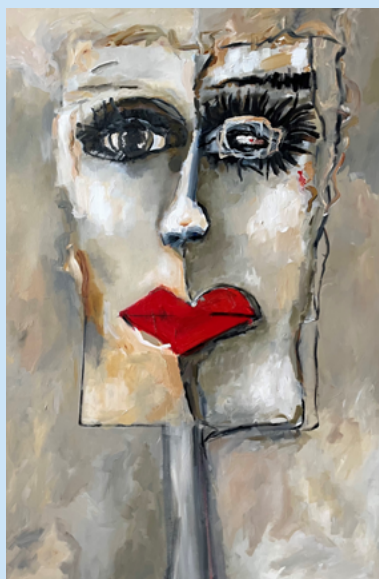
Dame #36 "Wild. Fire." , acrylic on canvas, Raeanne Schachter