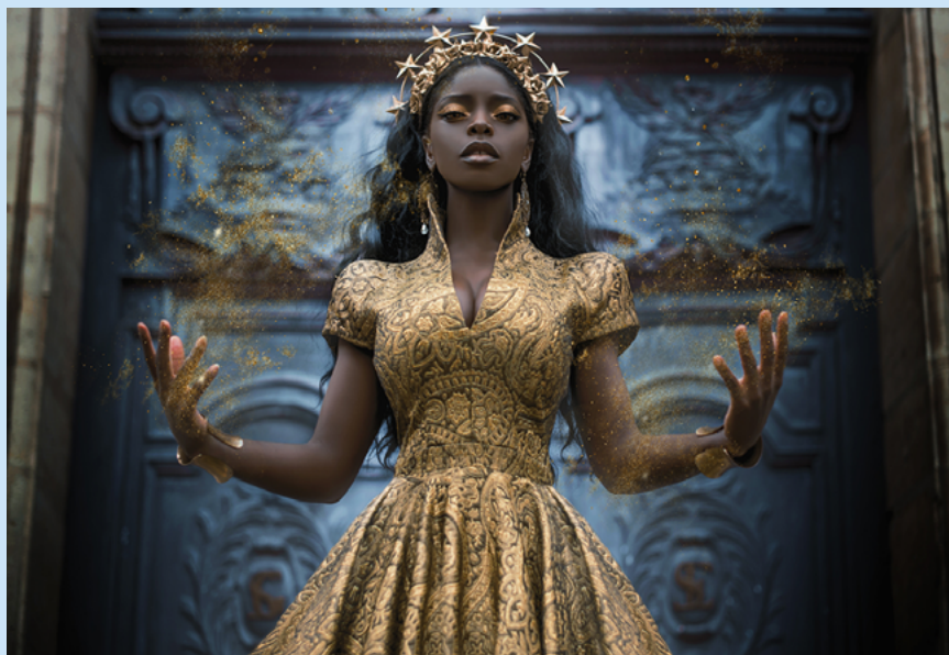
Solar , photograph, Lillian Liu

Virtual tours of our exhibitions will be available for viewing approximately one week after the exhibition opening until the exhibition end date. Visit the individual exhibition pages at placedesarts.ca/exhibitions to view.