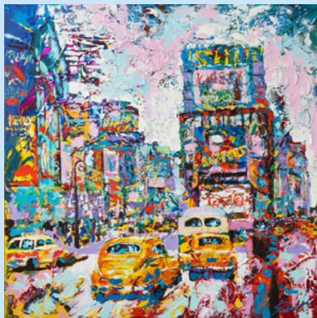
Happy New York 1970s – abstracted portrait , acrylic on canvas, Tadaomi Kawasaki