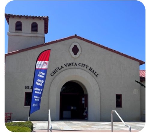
Front of Chula Vista City Hall with a voting banner outside.