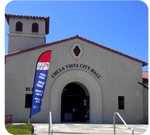
Front of Chula Vista City Hall with a voting banner outside.