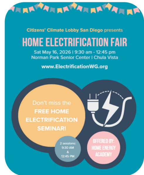
Flyer with details about Home Electrification Fair

The program will provide an overview of fundamental concepts in home electrification and energy efficiency, including heat pump systems, induction cooktops, electric vehicle charging, ventless electric dryers, and solar energy solutions.