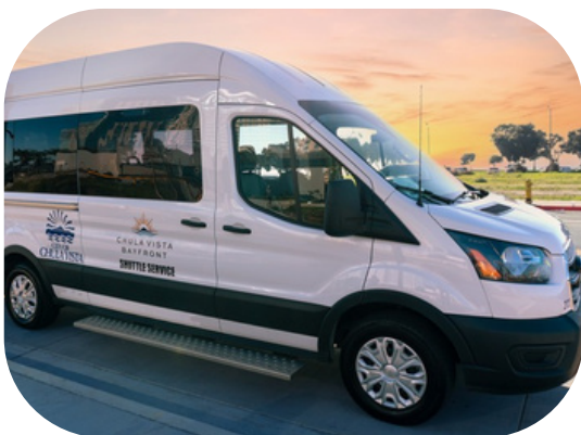
A photo of the Bayfront Shuttle in front of the Chula Vista Bayfront at Sunset

The City of Chula Vista is making it even easier for residents and visitors to explore its scenic waterfront this summer.