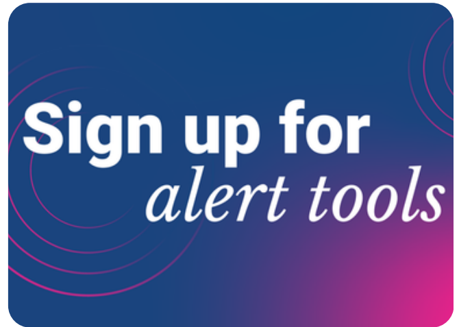
A graphic with text that reads "Sign up for alert tools."