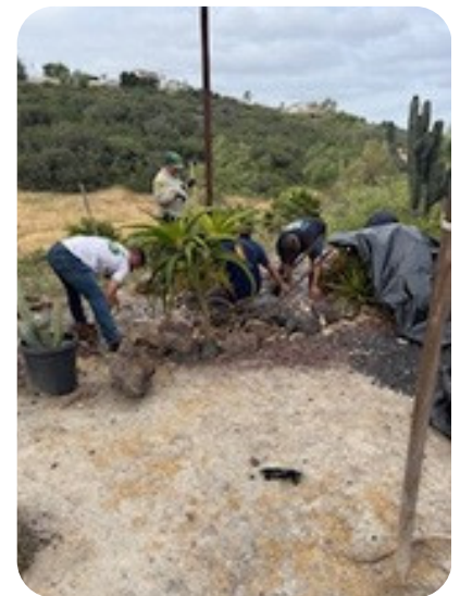
Team of people working on restoring the riverbed area of the Rice Canyon.

This project is a true example of collaboration, with every partner contributing to a successful outcome.