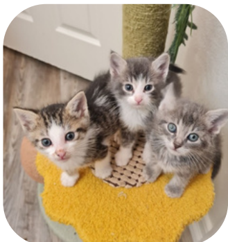
A photo of three foster kittens

Kitten season has arrived, and Chula Vista Animal Services is experiencing an influx of orphaned kittens who need immediate care. Many of these young kittens are not yet old enough for adoption and simply need a quiet, nurturing home environment where they can grow, play, and thrive until they're ready for their forever families.