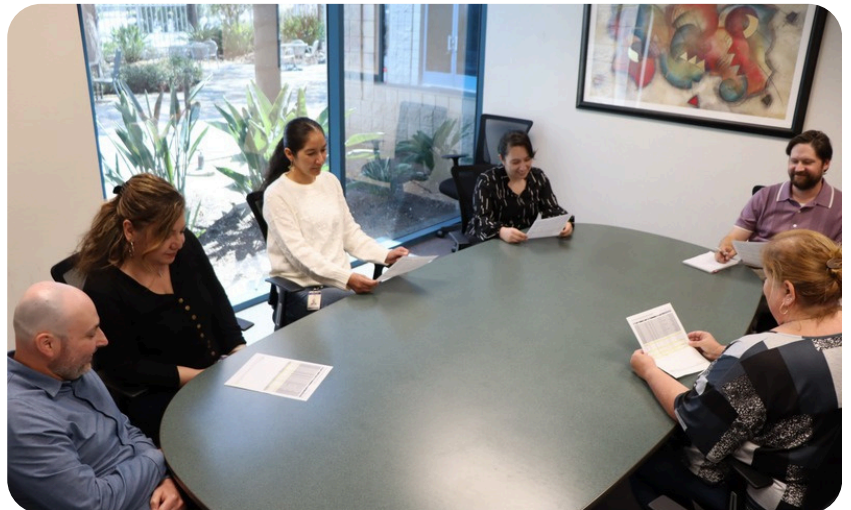
Photo collage highlighting Public Works Appreciation Week at the City of Chula Vista. Images show Public Works employees performing infrastructure maintenance in the field, repairing equipment in a maintenance shop, servicing a City vehicle and participating in an office meeting.

As Public Works Week approaches, we're proud to celebrate this year's theme, "Rooted in Service, Powered by Community." In Chula Vista, our Public Works team embodies this every day. The roots of our service run deep—through the highly visible work that shapes our city and the essential behind-the-scenes efforts that keep it running.