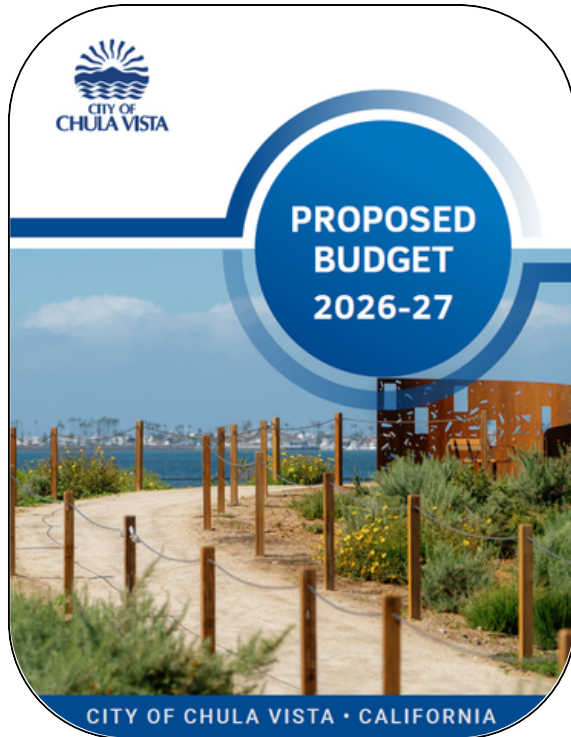
Photo of Sweetwater Park trail overlooking the Coronado Bridge with text "Proposed Budget 2026-27."

The City Manager presented the proposed Fiscal Year (FY) 2026-27 budget to the City Council on May 5. The $661 million proposal includes a balanced General Fund operating budget of $318.1 million and a Capital Improvement Program (CIP) budget of $40.4 million.