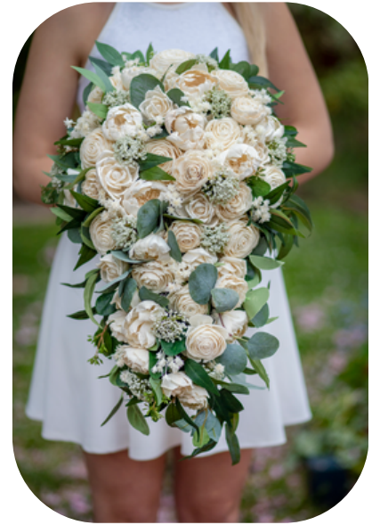
A photo of a bridal bouquet

Luv Sola Flowers is located at 2970 Faivre St., Suite 100. They are open Monday through Friday from 8 a.m. to 4 p.m. You can follow Luv Sola Flowers on Instagram at @luvsolaflowers .