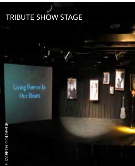
TRIBUTE SHOW STAGE

1701 Fourth Street SW, Albuquerque, NM 87102 www.nhccnm.org 505-724-4771