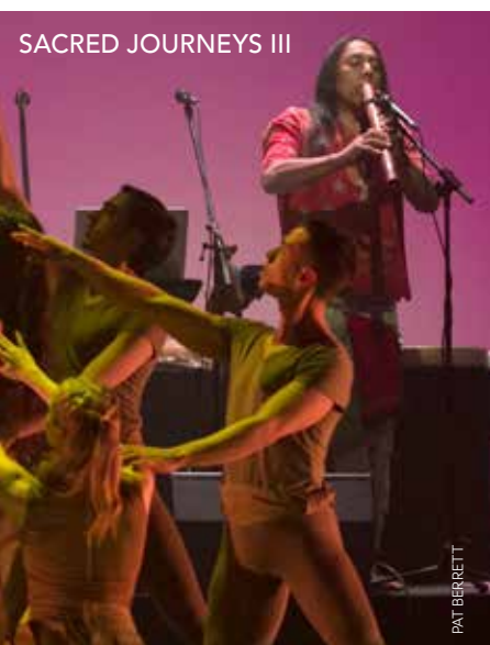
SACRED JOURNEYS III

storytellersofnewmexico.org | info@storytellersofnewmexico.org