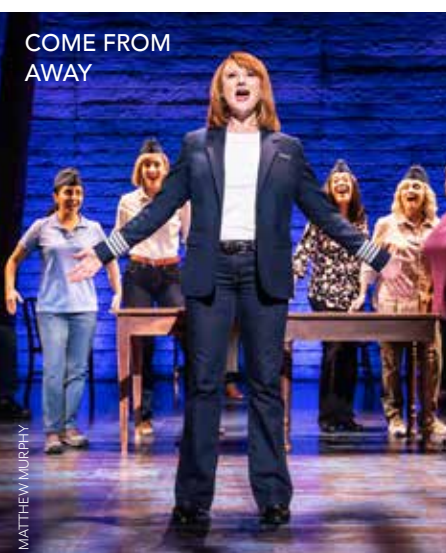
COME FROM AWAY