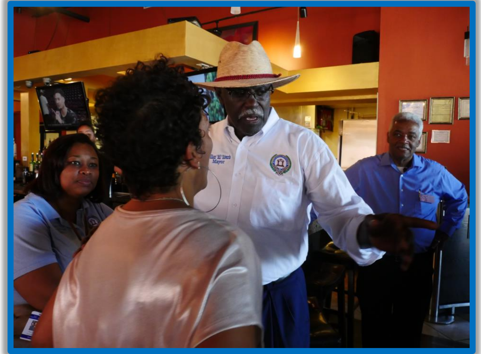
Mayor Edwards engaging with small business owners