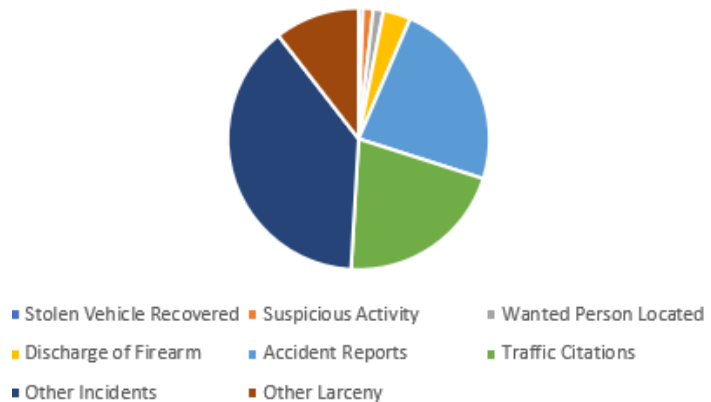
August Additional Incidents