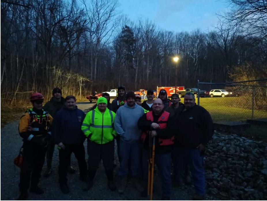
“It takes a village”