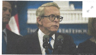
Gov. Mike DeWine of Ohio.