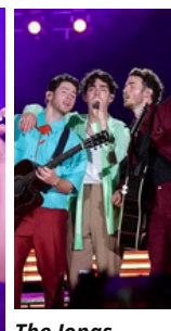
The Jonas Brother