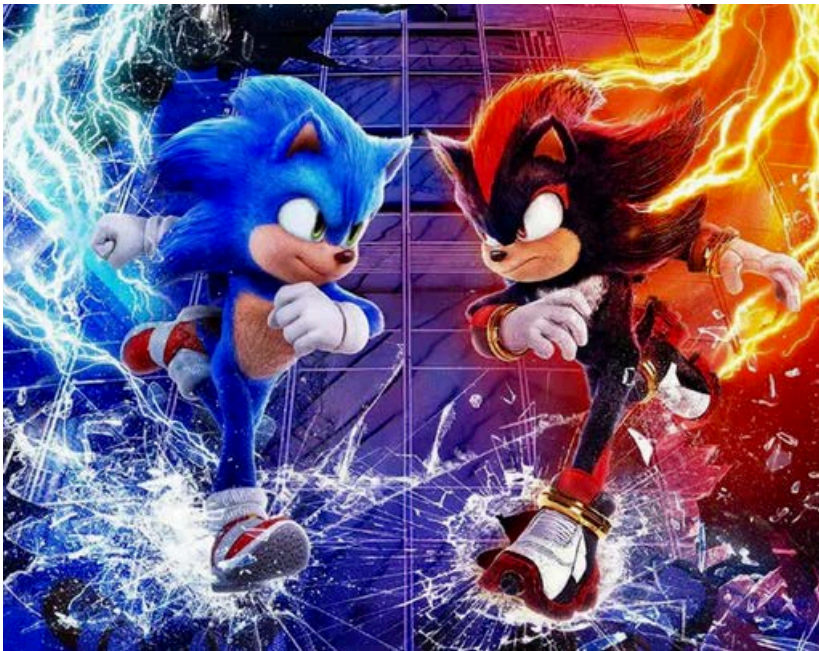
Sonic The Hedgehog 3