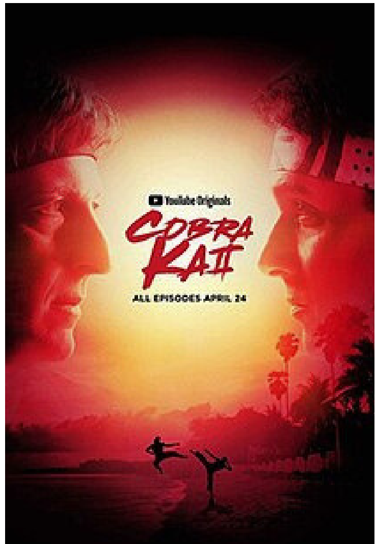
Cobra Kai Part 2

Cobra Kai Part 2 is coming on November 15th. There have been a few sneak peeks. Like iron dragons? Really? Why do the villains always have to be reptiles? It's getting on my nerves! Zara looks pretty cool, though. She is a karate influencer. Azel seems tough but is really a softie. Robby is losing his fight because he became obsessed with Tory and began to drink a lot. Both of his parents are alcoholics, he is going to get himself in trouble. Miguel is also jealous of Robby because he thought that he should have gotten the captainship title. Hawk and Demetri are still fighting. Daniel is too focused on the truth of what happened to Mr. Miyagi. Johnny and Daniel still do not see eye to eye. Honestly, it seems a little repetitive of the original Karate Kid, but not good. Devon is also getting on my nerves. She cheated and is now going to see the consequences of her actions. It was not a surprise that the iron dragons were silver. Iron is a metal, and metal is silver.