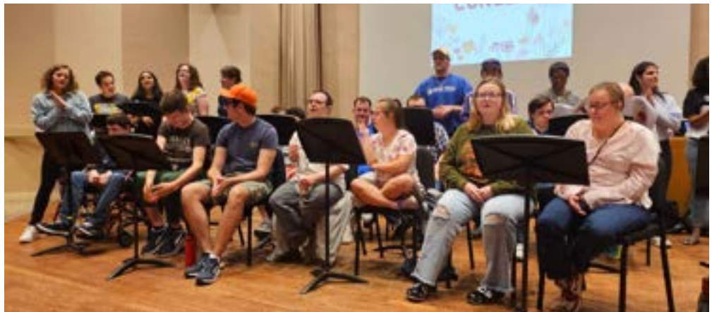
The AMASE Choir Concert