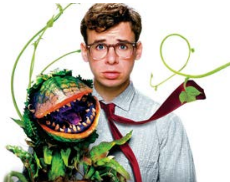
Little Shop of Horrors

We got ready and wore fancy clothes to the Moretti's in Skokie. I got grilled chicken alfredo, it was good. After that, we went to see a show at The Northshore Theatre. We saw Little Shop of Horrors. The introduction song was the same: Skid Row by Downtown. John Belushi, from the movie version, was also in the show. It was a good performance.