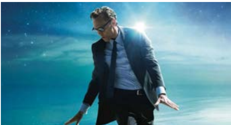
The Life of Chuck (2024)

On Friday, we went to see Stephen King's story adaptation and brand-new film The Life Of Chuck . It is about him and his whole life from top to bottom. Chapters one, two, and three are about how it all started. Before, his life was happy when he went into his happy place. He was well known to the public. He was a good dancer back then. Until that one day in the present, Chuck wasn't really his name. It was really Charles Chuck Krantz. Throughout the years of his life when everybody kept saying "Thanks Chuck", Charles lived his life in the past, present, and future. He used to remember what his life was like in a blink of an eye. When he was inspired by music, he would dance into the night. He was well known to everyone from walking into everybody's lives. Nobody knows what he was up to or what he was doing all that time. That was why he was this really cool guy that we all know of.