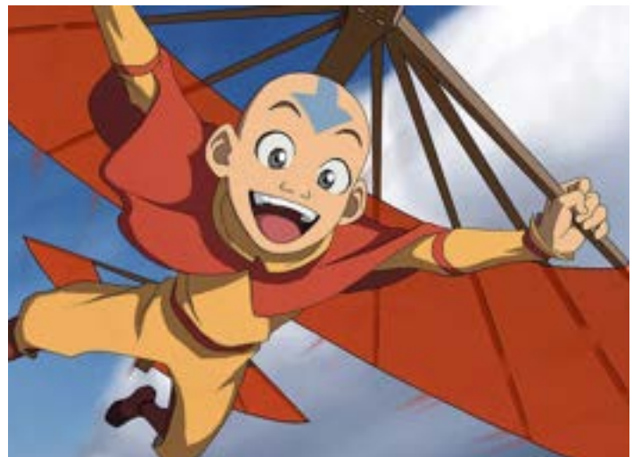
Avatar: The Last Airbender

Avatar: The Last Airbender is about a world divided into earth, water, fire, and air. The fire nation is the most powerful in their world. There are brother and sister Katara and Sokka that are part of the air-bending community but they don't get along yet. Katara is the last air bender of her community and she needs help to learn. They discovered Aang, who has no memories of his past lives. He can air bend without any trouble. He was stuck in the ice for a hundred years but looks and acts like a twelve-year-old child. He has a pet Bison who can fly. Aang will teach Katara air-bending. Little do they know that the fire nation is planning something.