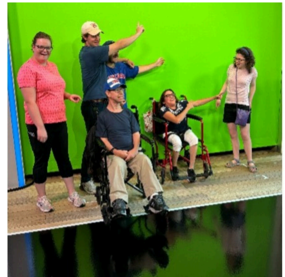
Green screen fun!