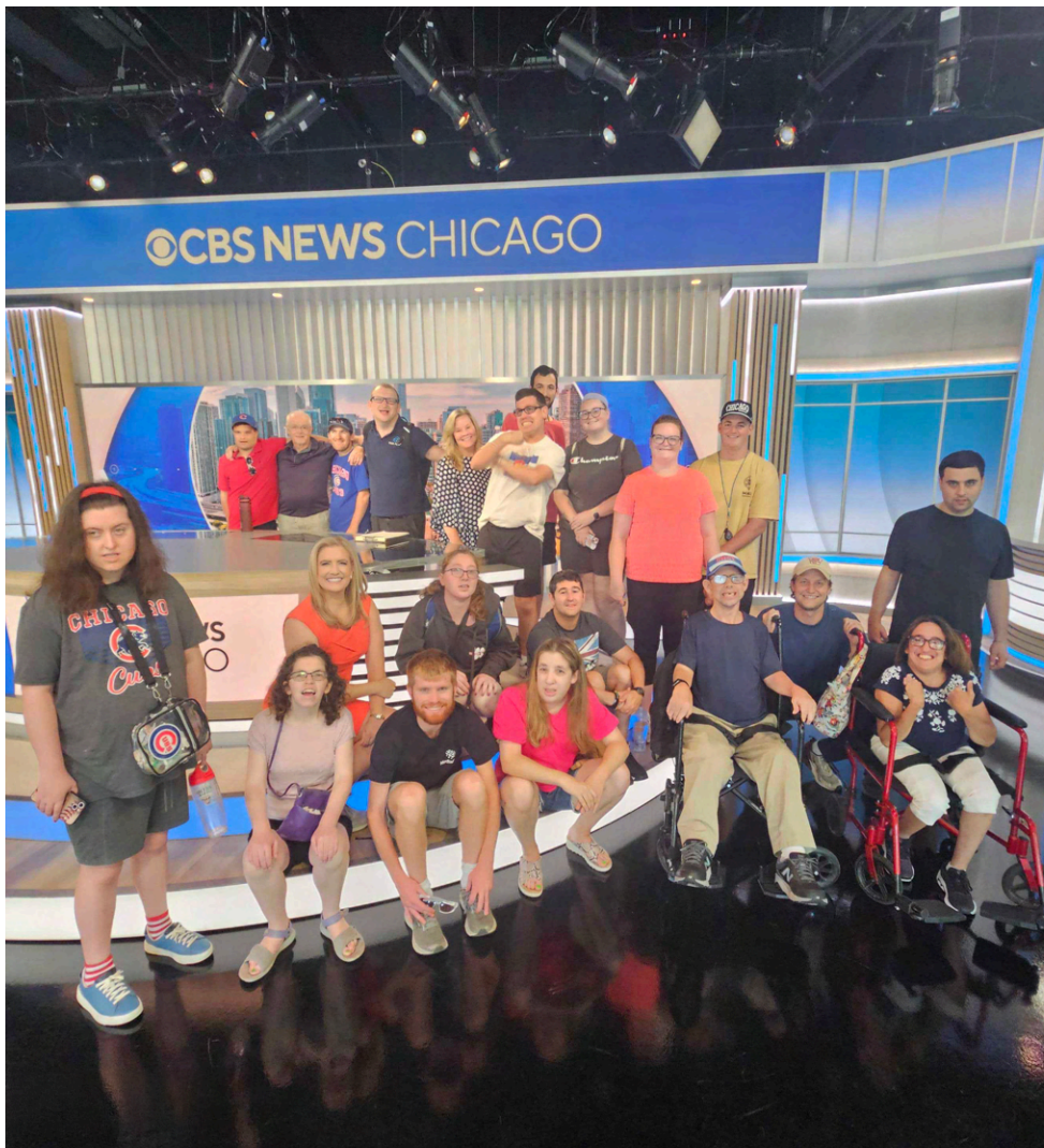
Everyone together at CBS News!