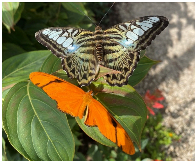
Butterflies at the garden